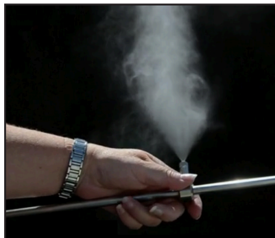
hand adjustable 360° collar rotation